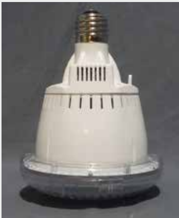
200W LED Retrofit Lamp replaces a 400W MH lamp