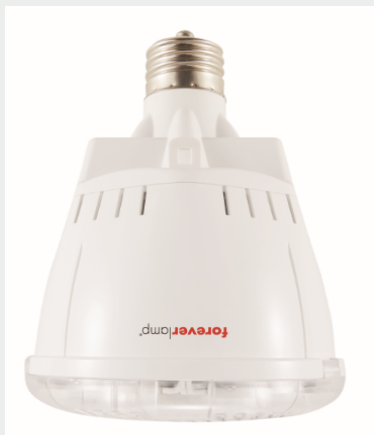
400W METAL HALIDE LED Retrofit Lamp PS-400D-SO-840