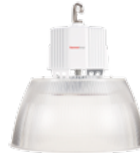
HB Classic HB2C/HB5C