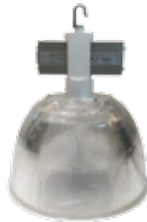
HB Series HB1/HB3