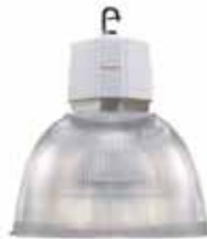
HB Classic HB1C/HB4C